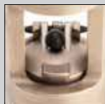
Model G Flapper

Model F, FGAC, and FGA Rubber Repair Kits Include: 4-Side Seals, 2-Piston Seals, 2-Springs Model F, FGAC, and FGA Metal Repair Kits Include: 1-Piston, 1-Valve guide, 1-Piston Seal Retainer